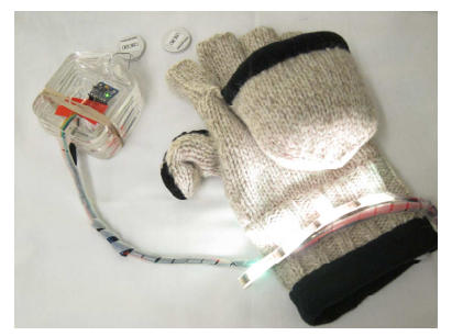
Figure 4 & 5: (Top) System Architecture. (Left) The first magic glove prototype.

composition. We therefore introduce an interaction called non-verbal sound tagging. A child could first tap on a LEGO module that is a soul stone, cast the spell "Guruguru", and then assign a sound effect using nonverbal voice utterances such as "Shu" for a laser gun or "Wuf" for a barking dog. The real sound effects would be attached to this module, and the child could activate the sound by shaking the object.